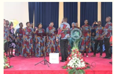
Great Hope Kicheko SDA Choir