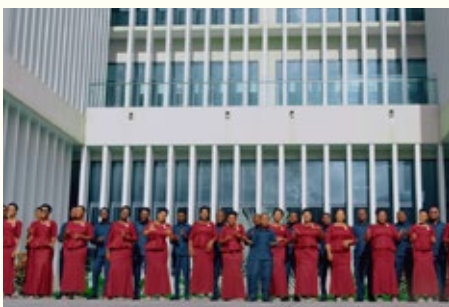
King'ongo SDA Choir