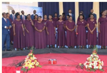
Syokimau Central SDA Choir