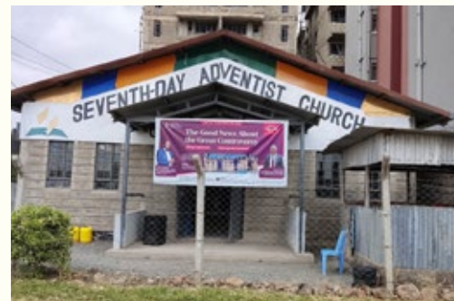
Great Hope Kicheko SDA Church