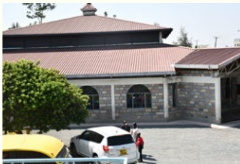
Syokimau Central SDA Church